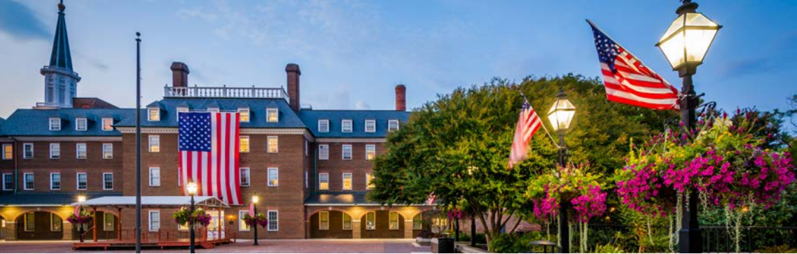
Market Square and City Hall at night in Old Town Alexandria, Virginia